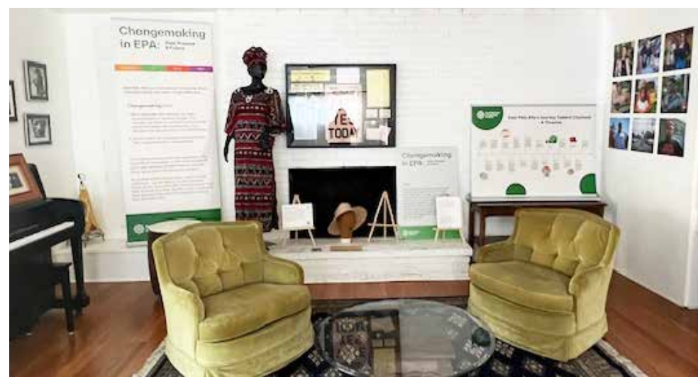
Image: EPACA headquarters in East Palo Alto.

Adding to the richness of this project is the partnership with the East Palo Alto Community Archive, an invaluable resource that preserves stories, artifacts, and oral histories from generations of residents. Artists can draw on this archive to deepen their understanding of East Palo Alto's journey and bring greater impact to their work. With access to archival materials and firsthand accounts, artists will be able to celebrate stories that are sometimes hidden or overlooked. This is more than just an art project; it is an invitation to become part of East Palo Alto's ongoing story and contribute a new chapter to its vibrant cultural legacy.