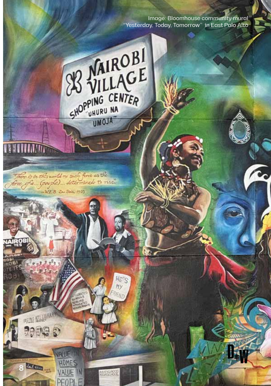
Image: Bloomhouse community mural "Yesterday, Today, Tomorrow" in East Palo Alto

The Artist or Artist Team awarded the public art commission at Cooley Landing will facilitate engagement, integrate community input, and lead the design process.